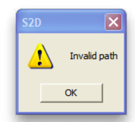
Figure 2. Syntax2D error dialogue box.

While creating a path isovist one evaluator unintentionally skipped necessary steps of creating observation points. When this error occurred, the evaluator was presented with an error dialog box that stated, "Invalid Path," as seen in Figure 2. Although the evaluator could see the path and had setup the path correctly, the evaluator had forgotten to create the observation points. Though an error dialog box appears it does not tell the user the necessary steps to fix the error. Instead, the error could read, "Must create Observations Points prior to running analysis." This would help guide the user in completing the task.