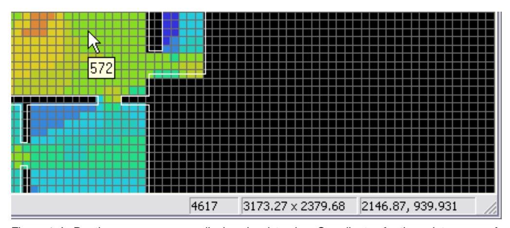
Figure 1. In Depthmap a mouseover displays isovist value. Coordinates for the point appear of the status bar.

becomes the foreground of the application and locks the main window. Consequently, users have to close the dialog box in order to restore the control of main window.